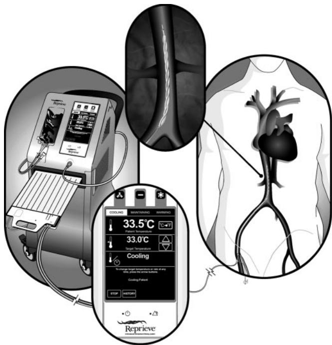
Figure 1. The Reprive Endovascular Temperature Management System.

pump that circulates cold or warm saline (figure 1). The target core body temperature was 33 °C (monitored with an esophageal probe). Cooling was maintained for 24 hours. Controlled rewarming was performed using the same catheter by setting the target temperature to 36.5 °C. Rewarming was performed at a rate of 0.2 °C/h. Shivering was suppressed using a forced-air warming blanket (BairHugger; Augustine Medical, Eden Prairie, MN), oral buspirone (60 mg), and IV meperidine (50- to 75-mg loading dose followed by an IV infusion at 25 to 35 mg/h).